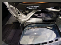
Enlarged Vertical Reference Window